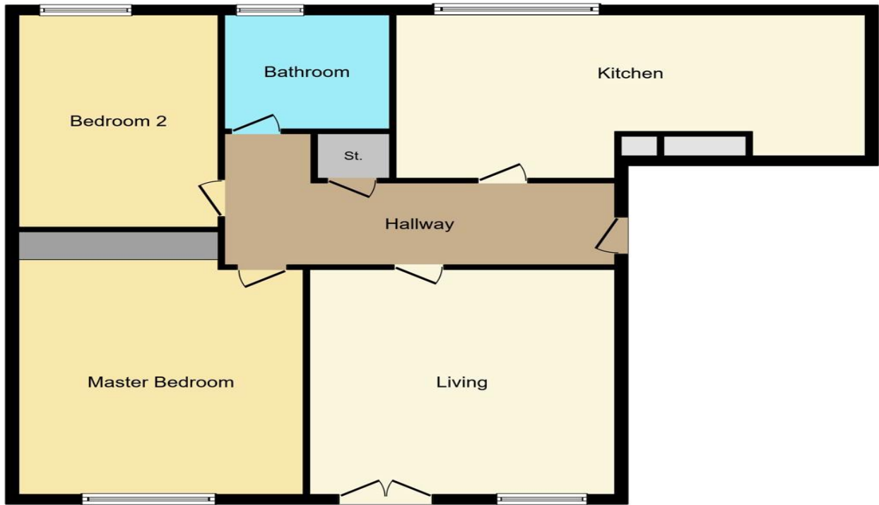
Floor area 111.0 sq. m. (1,195 sq. ft.) approx

Total floor area 111.0 sq. m. (1,195 sq. ft.) approx