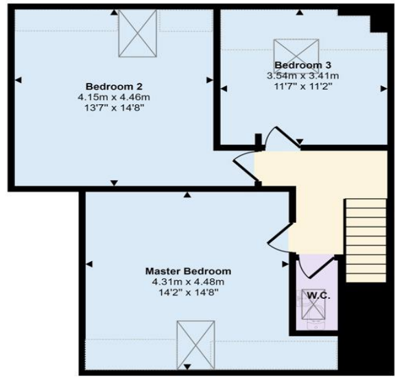
First Floor Approx 65 sq m / 695 sq ft