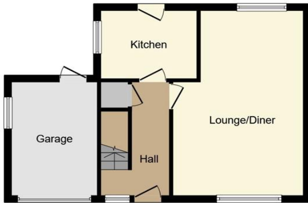
Ground Floor Floor area 42.7 m 2 (460 sq.ft.)