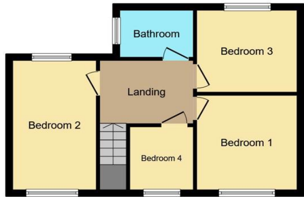
First Floor Floor area 43.4 m 2 (467 sq.ft.)