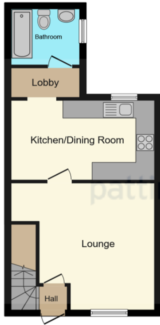
Ground Floor Floor area 39.5 m 2 (425 sq.ft.)