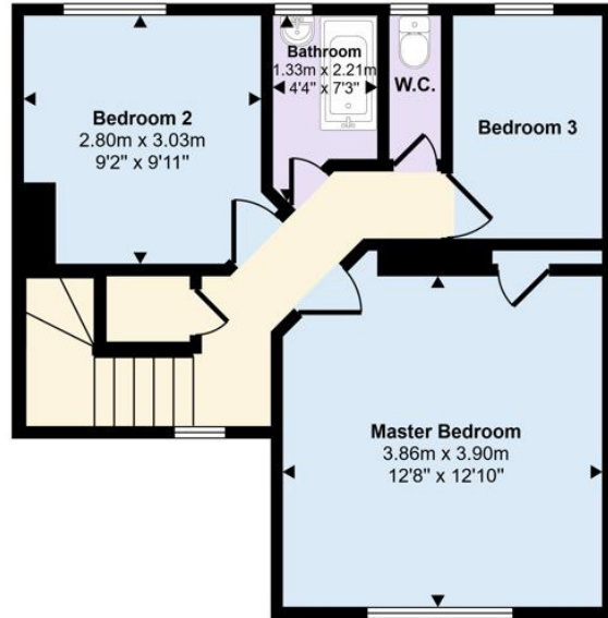
First Floor Approx 43 sq m / 459 sq ft

This floorplan is only for illustrative purposes and is not to scale. Measurements of rooms, doors, windows, and any items are approximate and no responsibility is taken for any error, omission or mis-statement. Icons of items such as bathroom suites are representations only and may not look like the real items. Made with Made Snappy 360.