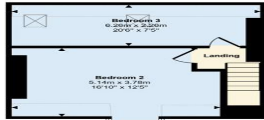
First Floor Approx 81 sq m / 869 sq ft