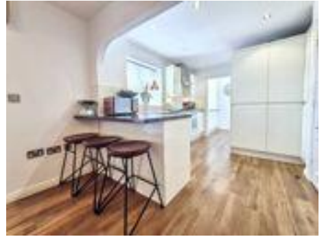
Kitchen / Diner.....