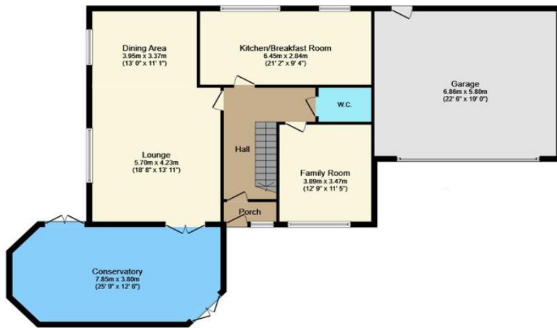
Ground Floor Floor area 157.7 sq.m. (1,698 sq.ft.)