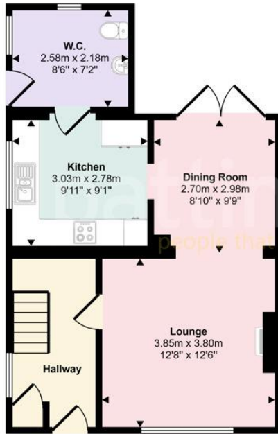
Ground Floor Approx 47 sq m / 506 sq ft

Approx Gross Internal Area 89 sq m / 953 sq ft