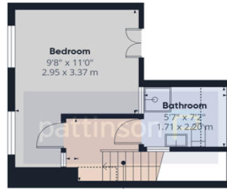
Landing 5'10" x 1'0" 1.80 x 0.31 m