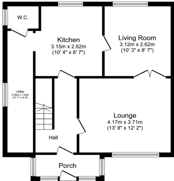
Ground Floor Floor area 59.8 sq.m. (644 sq.ft.)