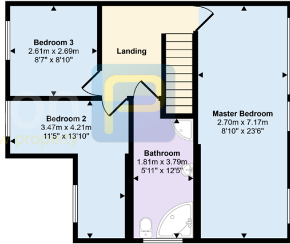
First Floor Approx 54 sq m / 583 sq ft

This floorplan is only for illustrative purposes and is not to scale. Measurements of rooms, doors, windows, and any items are approximate and no responsibility is taken for any error, omission or mis-statement. Icons of items such as bathroom suites are representations only and may not look like the real items. Made with Made Snappy 360.