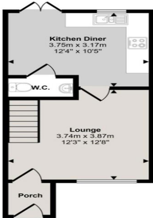
Ground Floor Approx 29 sq m / 309 sq ft

Approx Gross Internal Area 56 sq m / 605 sq ft