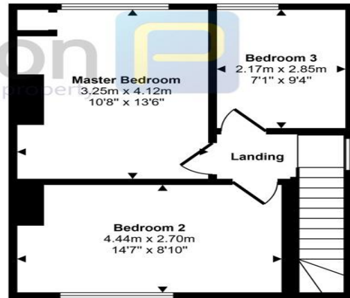
First Floor Approx 38 sq m / 410 sq ft

This floorplan is only for illustrative purposes and is not to scale. Measurements of rooms, doors, windows, and any items are approximate and no responsibility is taken for any error, omission or mis-statement. Icons of items such as bathroom suites are representations only and may not look like the real items. Made with Made Snappy 360.