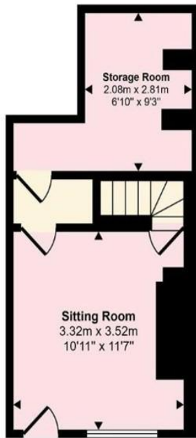
Ground Floor Approx 23 sq m / 248 sq ft