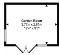
Garden Room Approx 11 sq m / 114 sq ft

This floorplan is only for illustrative purposes and is not to scale. Measurements of rooms, doors, windows, and any items are approximate and no responsibility is taken for any error, omission or mis-statement. Icons of items such as bathroom suites are representations only and may not look like the real items. Made with Made Snappy 360.