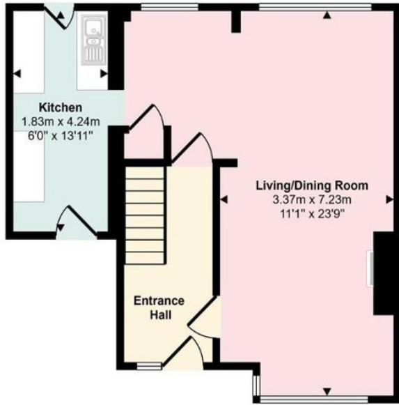
Ground Floor Approx 46 sq m / 492 sq ft

Approx Gross Internal Area 91 sq m / 982 sq ft