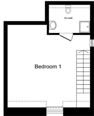
Second Floor Floor area 27.6 sq.m. (297 sq.ft.)

Total floor area: 95.2 sq.m. (1,024.7 sq.ft.)