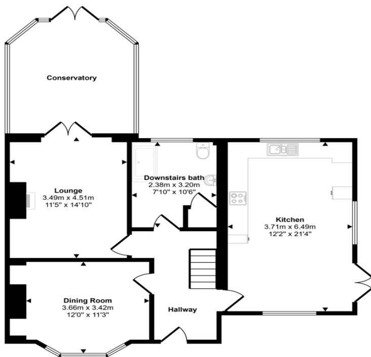
Ground Floor Approx 89 sq m / 954 sq ft

Approx Gross Internal Area 134 sq m / 1446 sq ft