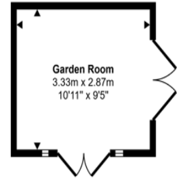
Outbuilding Approx 10 sq m / 103 sq ft

This floorplan is only for illustrative purposes and is not to scale. Measurements of rooms, doors, windows, and any items are approximate and no responsibility is taken for any error, omission or mis-statement. Icons of items such as bathroom suites are representations only and may not look like the real items. Made with Made Snappy 360.