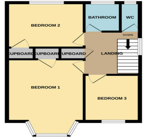
3 BEDROOM SEMI

Whilst every attempt has been made to ensure the accuracy of the floorplan contained here, measurements of doors, windows, rooms and any other items are approximate and no responsibility is taken for any error, omission or mis-statement. This plan is for illustrative purposes only and should be used as such by any prospective purchaser. The services, systems and appliances shown have not been tested and no guarantee as to their operability or efficiency can be given. Made with Metropix ©2026